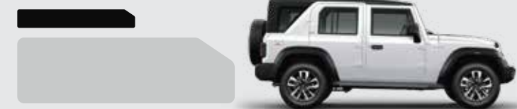
Everest White Black