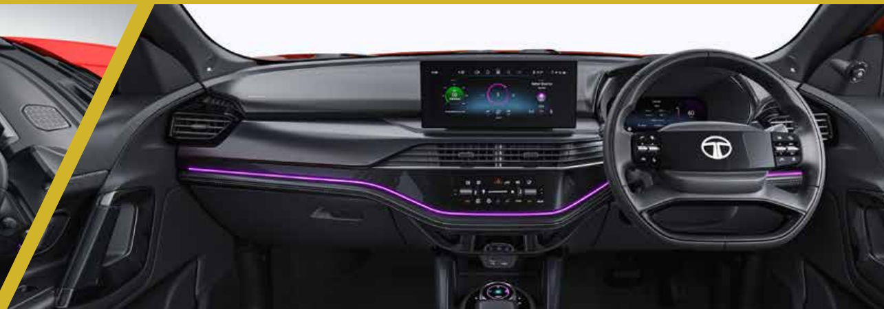
THEMED DASHBOARD WITH MOOD LIGHTING