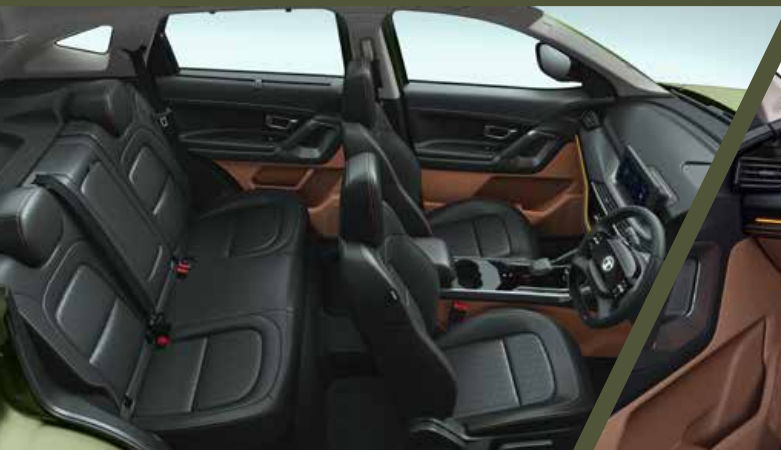
PERSONA THEMED INTERIORS