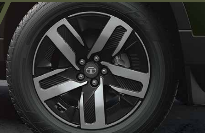
R18 ALLOY WHEELS WITH AERO INSERTS