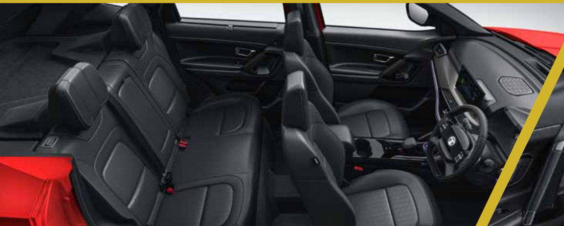
EXCLUSIVE INTERIOR FOR CORAL RED, PEBBLE GREY & LUNAR WHITE