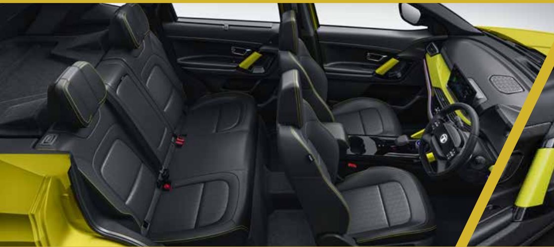
EXCLUSIVE INTERIOR FOR SUNLIT YELLOW