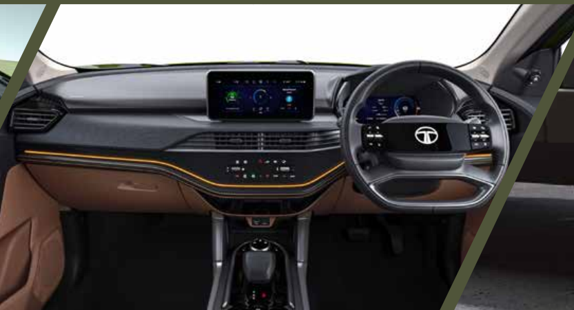
THEMED DASHBOARD WITH MOOD LIGHTING