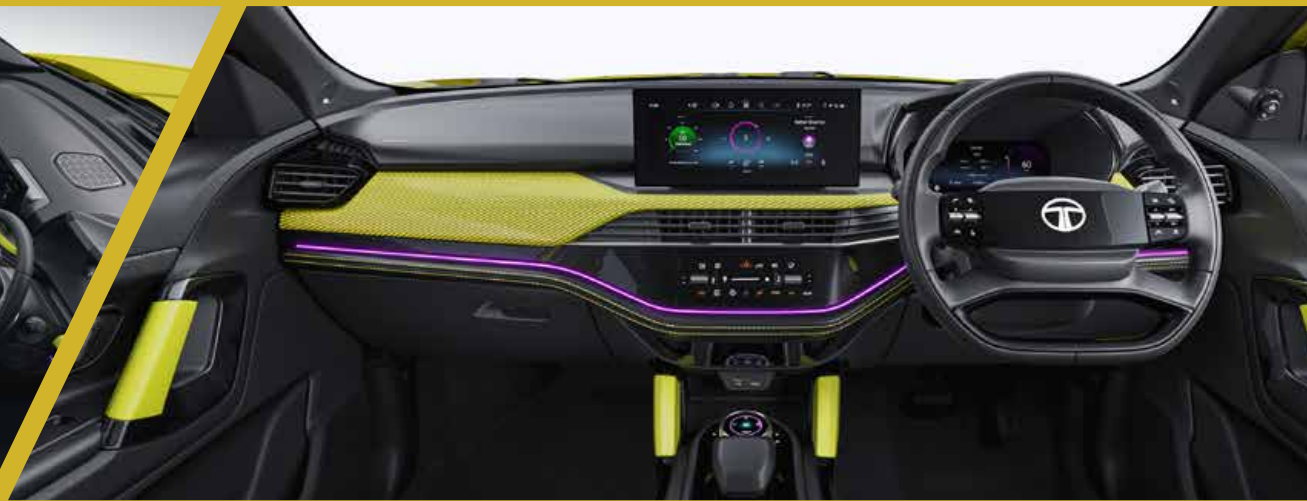
THEMED DASHBOARD WITH MOOD LIGHTING